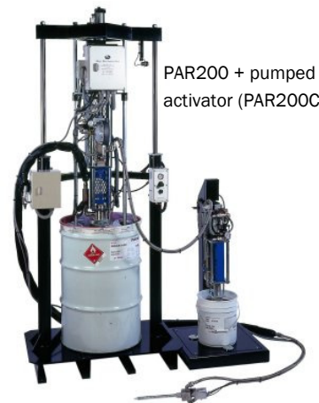
PAR200 + pumped activator (PAR200C)